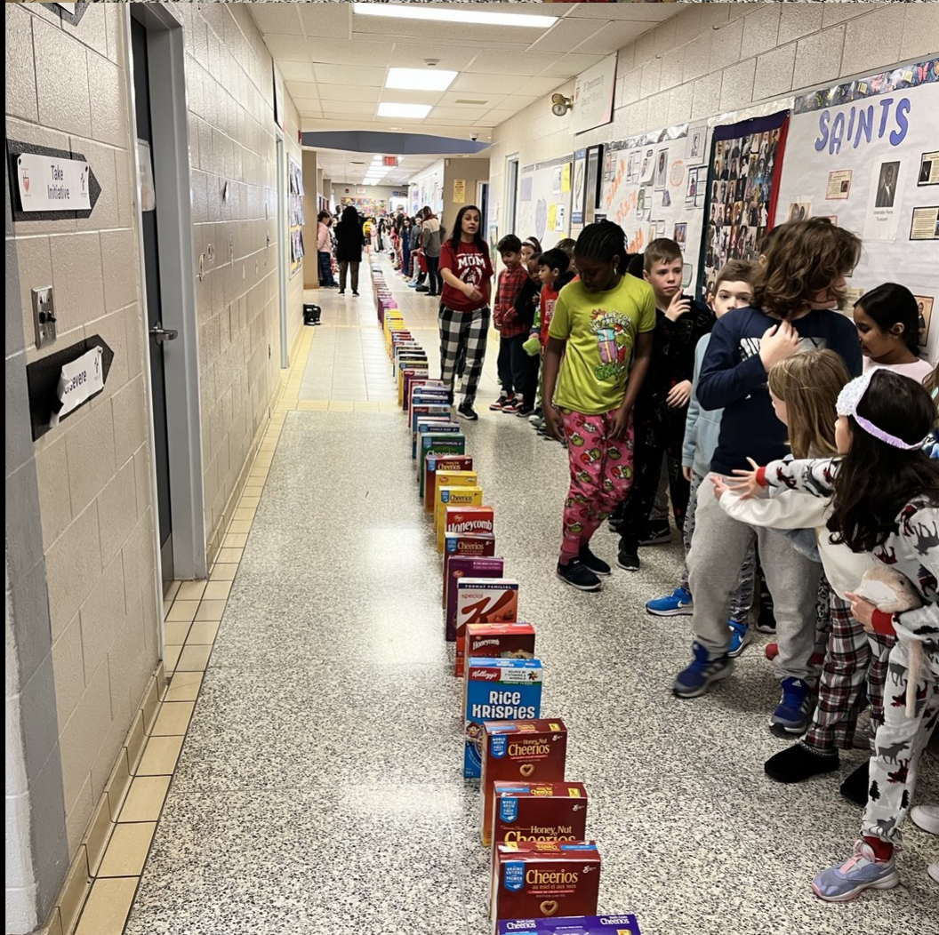
Cereal Box Challenge